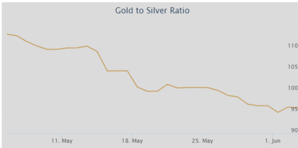
Gold-Silver Ratio May/June 2020

or downside, and with the right GSR, it may then make sense to swap silver for gold. Savvy metals investors have used this technique to reap even greater returns – without ever jeopardizing their position in this bull market for precious metals.